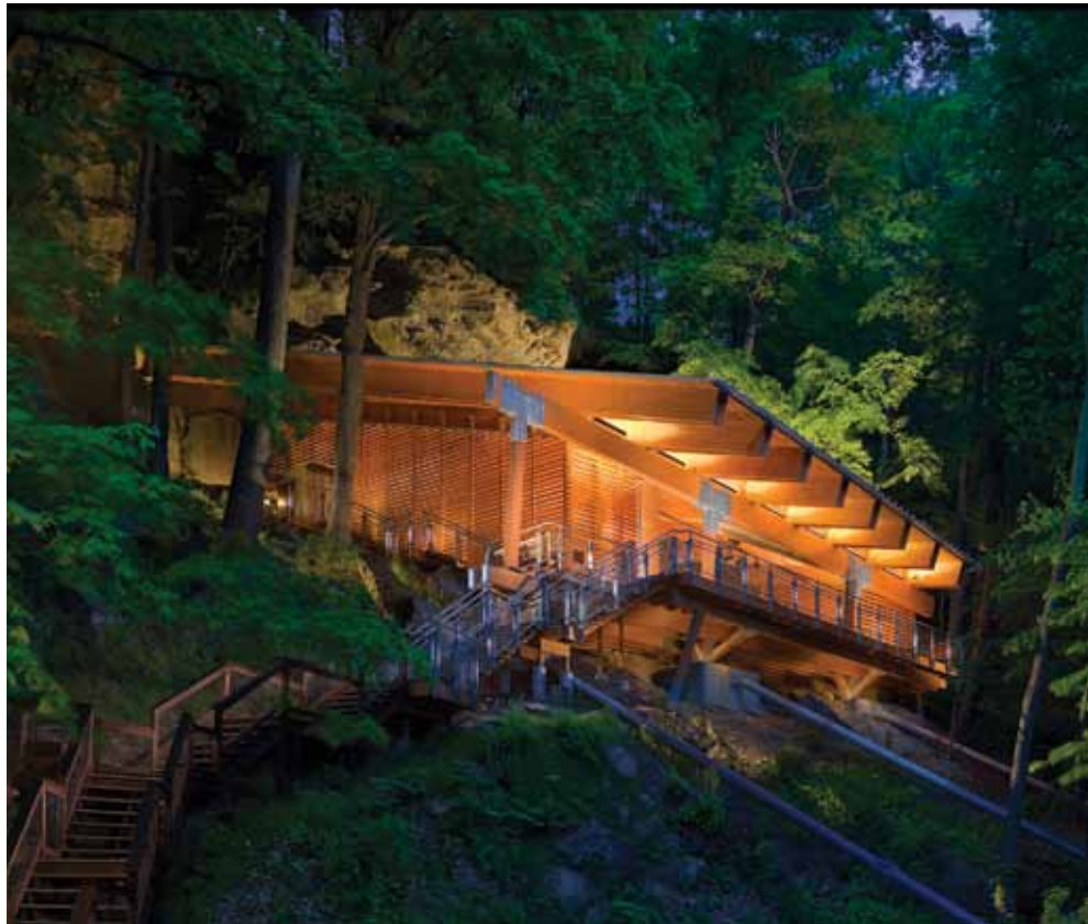
Above: Wood was chosen as the primary building material for many reasons; among them, its ability to be easily customized in the field to conform to rocky terrain.

Excavations have yielded over two million artifacts (objects created by people) and ecofacts (naturally-derived objects, such as seeds or bones) from a series of eleven strata concealed in sixteen feet of sediment.