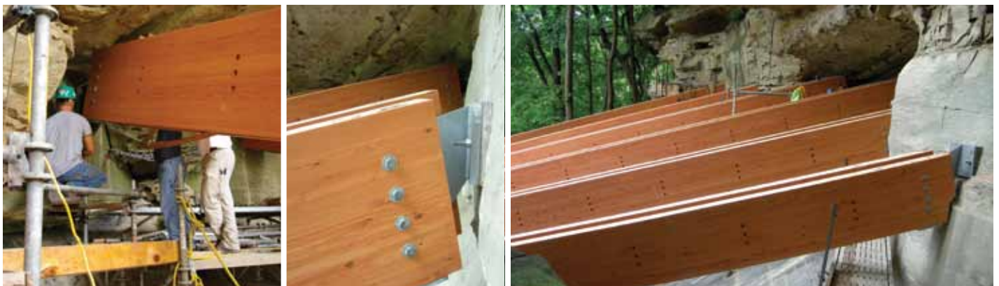
CONSTRUCTION – BEAM STRUCTURE AND DETAILS