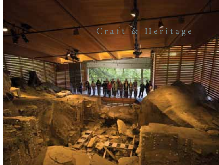
Above: The data collected from the Meadowcroft Rockshelter excavations has broad-reaching implications for determining migration patterns of the first Americans. Opposite: The large overhang roof is canted to direct rainwater away from the site and to maintain indirect lighting. The primary viewing platform underneath accommodates roughly 30 visitors.

The design solution inherently combines sustainability and resource protection. Highlights include: selecting wood as the primary construction material, and employing it in numerous applications, including posts, beams, walls and roof; limiting the physical interaction between the main structural members of the enclosure and the ground to three points; implementing hand-digging techniques when constructing the footers to avoid vibrations, which might have jeopardized the site; hanging the wall system from the roof rather than supporting it upon typical foundations in the ground; retaining the 1970s-era roof in order to protect the dig until the new enclosure was completed; limiting tree removal at the site and using as little machinery as possible; orienting the enclosure to maximize natural light, while also controlling it; strictly following the archaeology standards of The Secretary of the Interior and of the Advisory Council on Historic Preservation; and constant cooperation between the owner, architect and Dr. James Adovasio on the concept and its implementation.